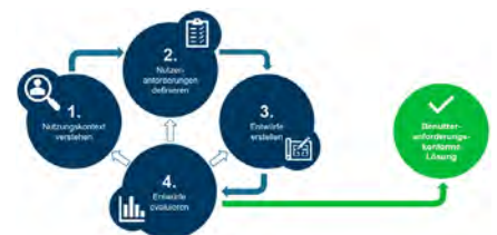
User-Centered Design (UCD) cycle according to DIN ISO 9241-210